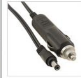
CAR POWER CORD